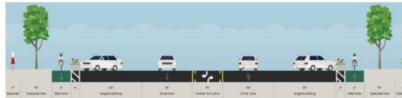
TYPICAL SECTION NOT TO SCALE

All utilities shown on this plan are based on available records. It shall be the sole responsibility of the contractor to verify all existing utilities by contacting utility agencies and to avoid damaging existing utilities during excavation. FOR UNDERGROUND SERVICE ALERT CALL: 1-800-227-2600